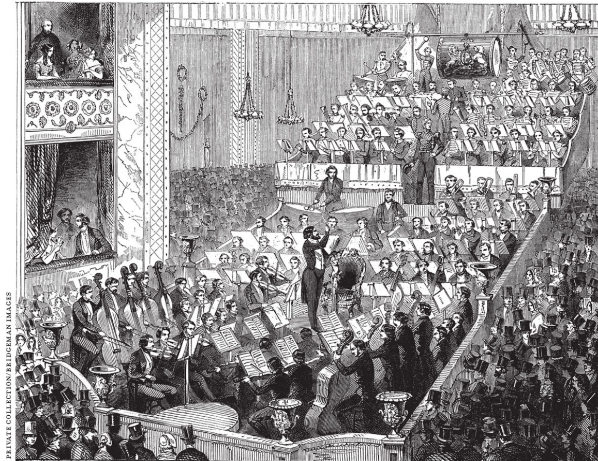
FIGURE 26.4 Concert at Covent Garden Theatre in London, showing Louis Jullien (in the center of the picture) conducting his orchestra (in front) and four military bands (on risers in back). In the middle of the musicians, who are surrounded on three sides by the audience, Jullien conducts without a score, turning as needed to give cues—as much the virtuoso (and center of attention) as any opera star.