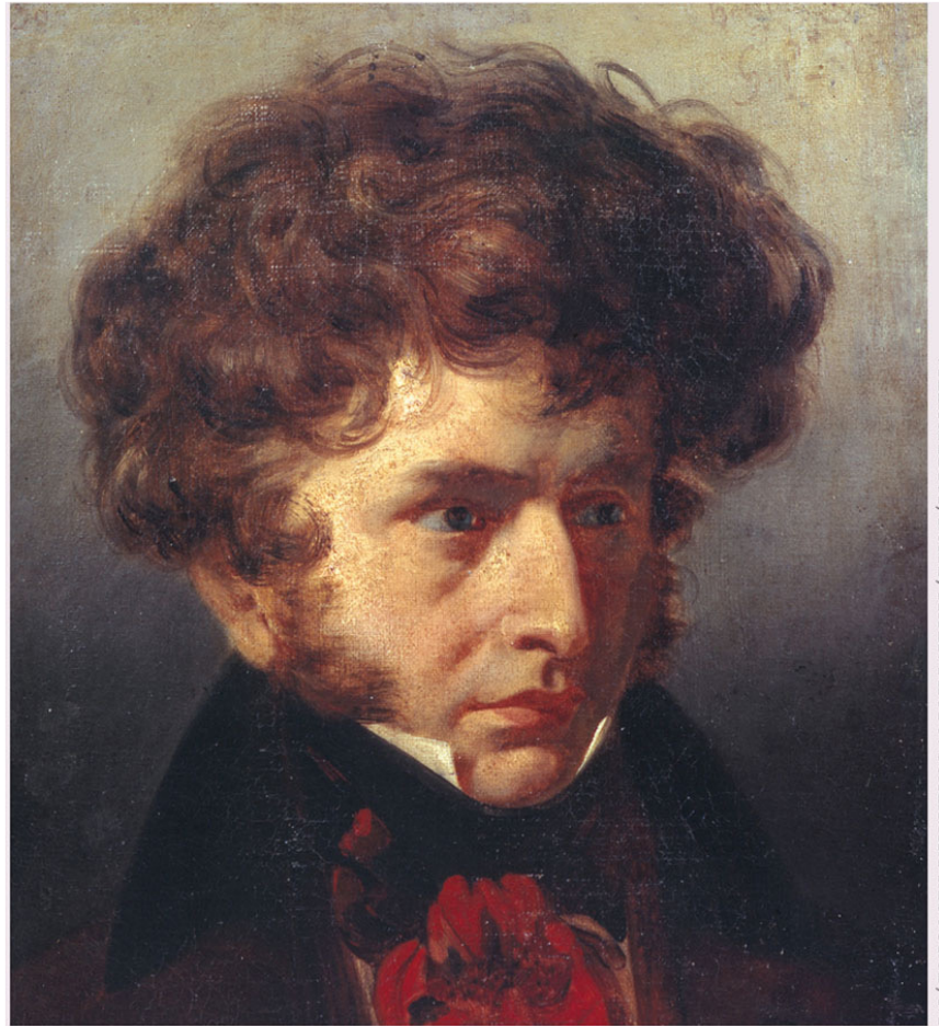
FIGURE 26.5 Hector Berlioz, in a portrait by Emile Signol painted in 1832 during Berlioz's sojourn in Rome.

Copyright © 2019, W. W. Norton & Co., Inc.